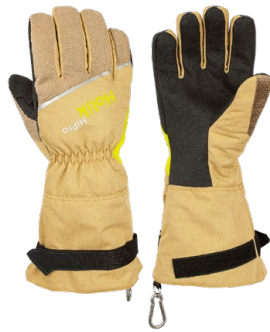
Maris Long Beige PTFE