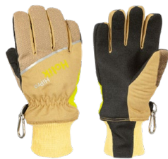
Maris Short Beige PTFE