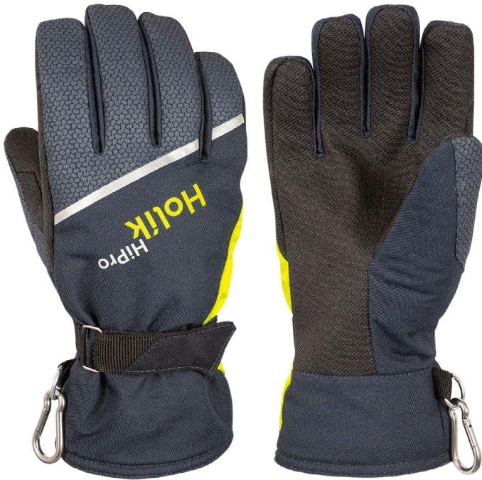
Maris Compact PTFE

Protective gloves for firefighters – textile – with membrane