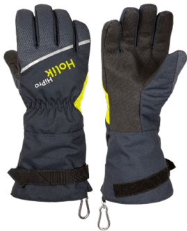
Maris Long PTFE