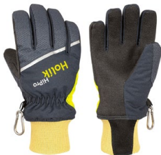
Maris Short PTFE